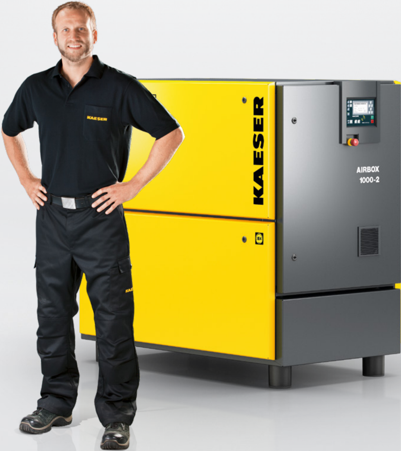
Image: AIRBOX 1000-2