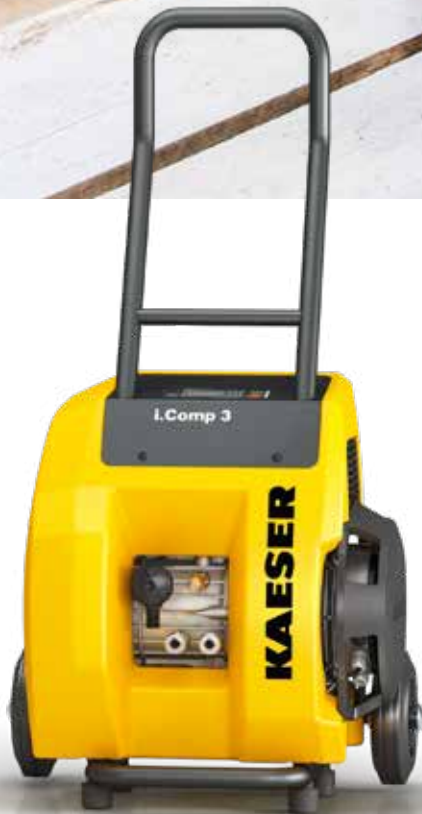
Fig.: i.Comp 3