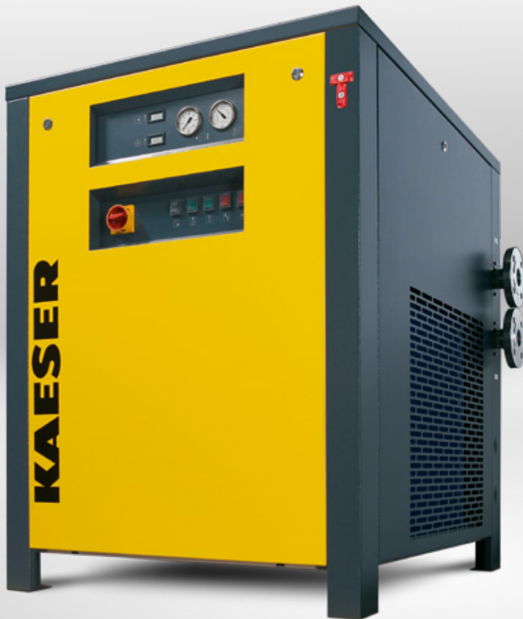
Standard version THP 40-50