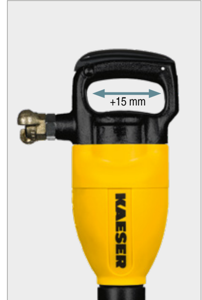
Wider grip aperture