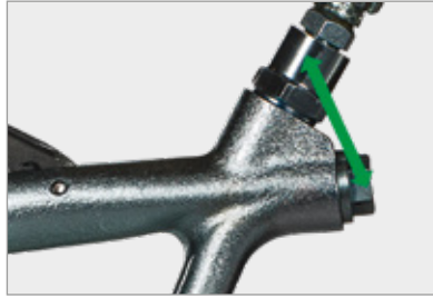
Male stud handle fitting