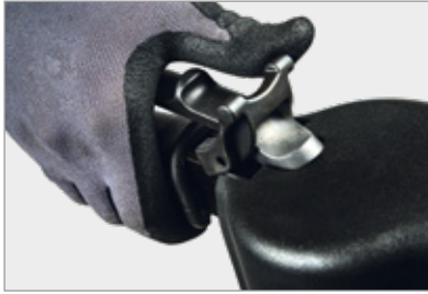
Ergonomic trigger lock